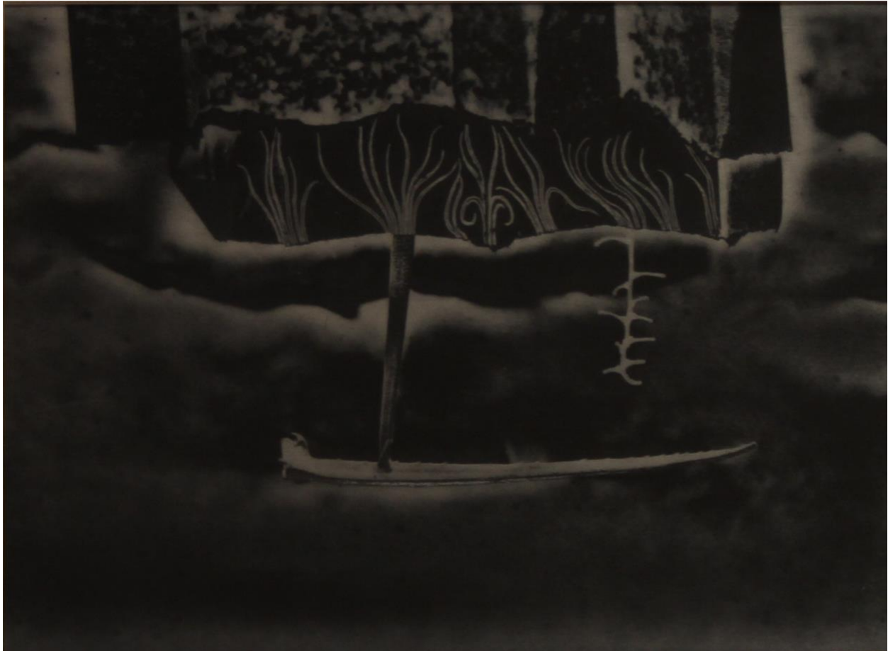
Charlie Arnold, "Untitled," 1970.

electrostatic charge. The plate is then transferred to a large format camera. Snap! The areas exposed to light on the plate lose their positive charge, and the plate is placed back in the Big Metal Box into a drawer with dry toner and rotated. The negatively charged toner is attracted to the areas that have not lost their positive charge due to exposure to light. A piece of paper is laid over the the plate and zapped once again. Once removed from the plate the sheet of paper is placed in a small oven and the heat fuses the toner to the paper and gives the image the recognizable Xerox sheen. Each step, nowadays executable with the push of a button, invites recalculation, recalibration and rearrangement.