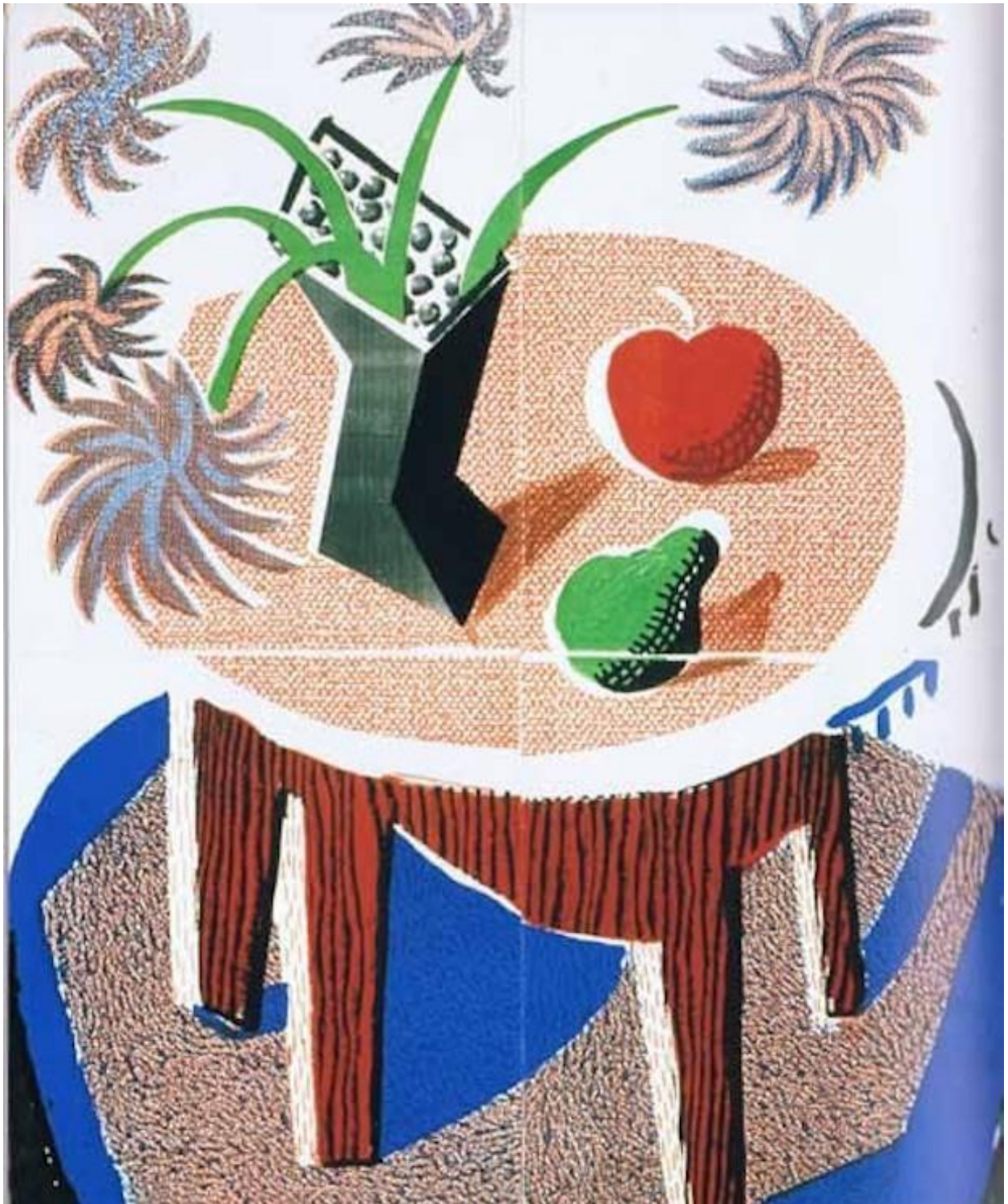
David Hockney, "Flowers, apple, pears on table," 1986.