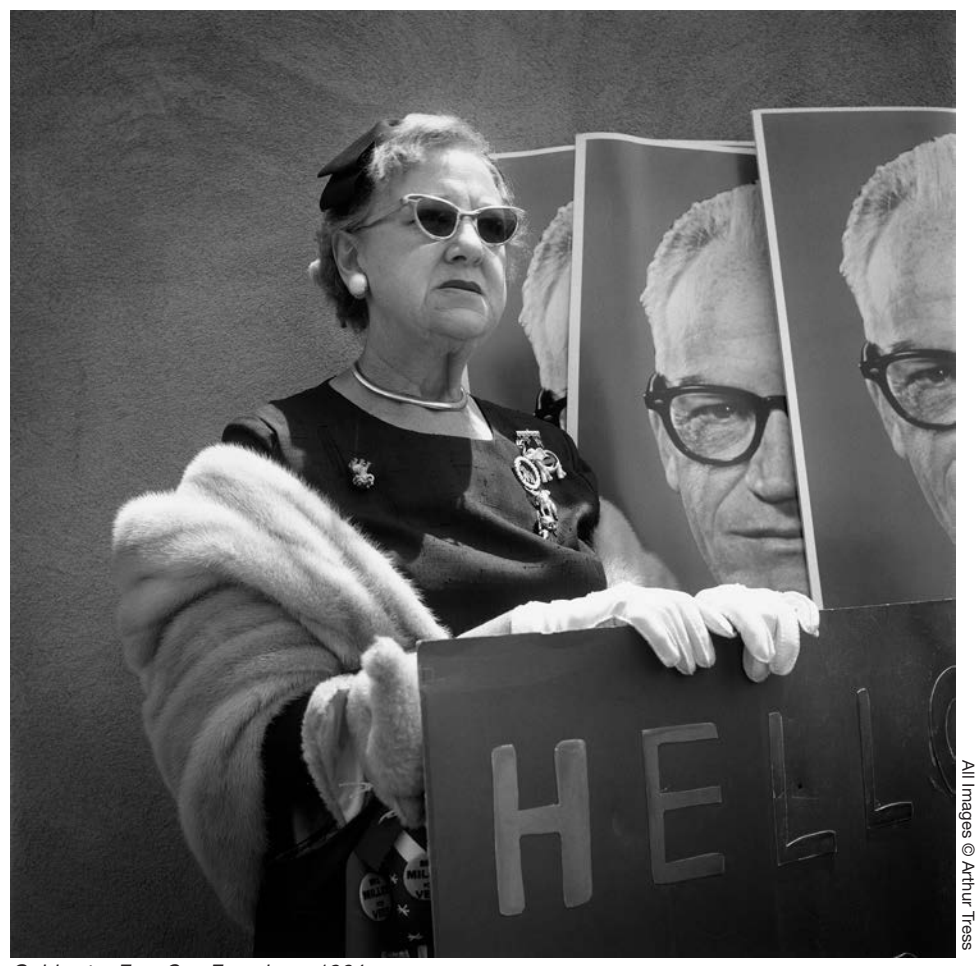
Goldwater Fan, San Francisco, 1964

RH: What have you learned about photography?