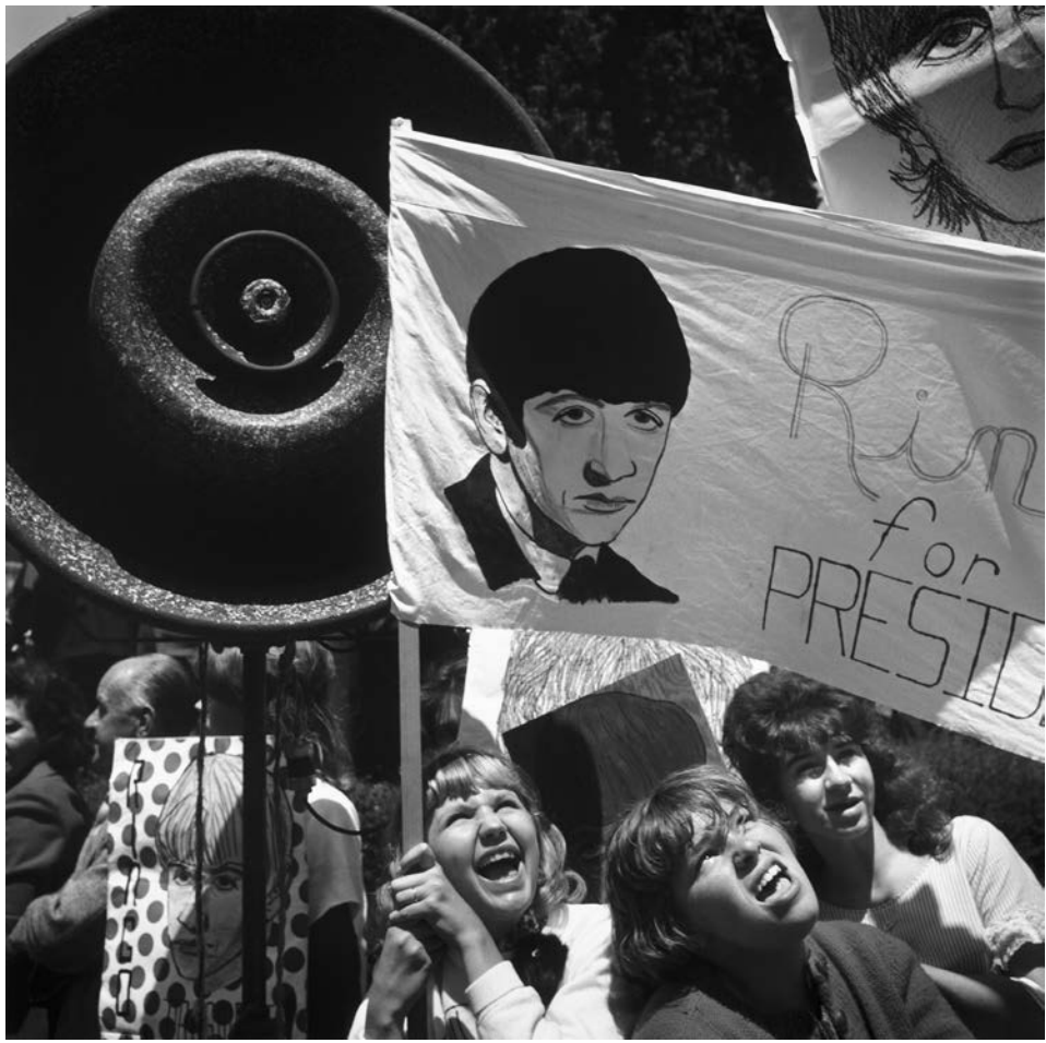
Ringo for President, San Francisco, 1964

my head, like being chased by monsters, and allow the real world to produce the kind of things I am thinking about. For example, Flood Dream (1970) resulted from photographing kids playing on the roof of a house sitting around a pier. I asked one to put his head through the roof, which was firmly on the ground. It is not as if I am setting this whole thing up. Rather, I magically pull all these ingredients together and it comes together into a Tress photograph.