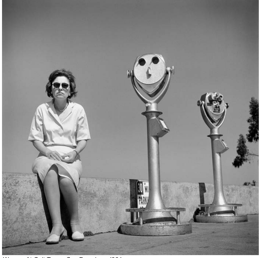
Woman At Coit Tower, San Francisco, 1964