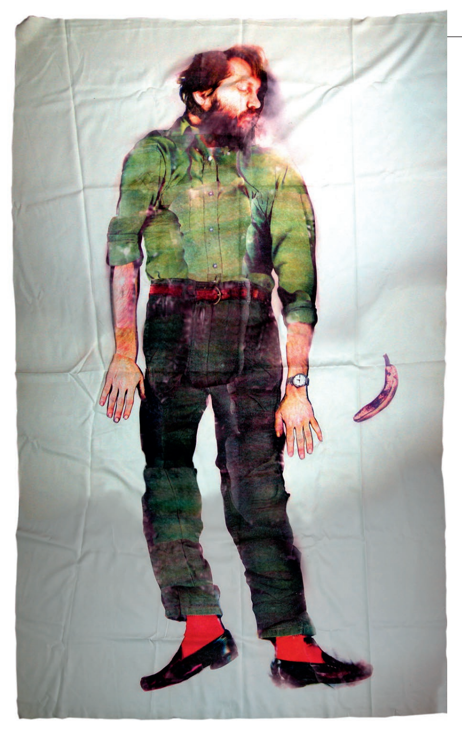
© Keith Smith, Untitled, 1972. 40×66 inches. 3M Color-in-Color transfers to bridal satin.

of the earliest artists presented in this book laid the groundwork for the cerebral and deadpan cultural messages delivered by the practitioners of photographic conceptualism in which ideas take precedence over how the subjects are depicted. Finally, it concentrates on those artists who consider themselves to be in the photographer camp rather than the painter alliance. This includes artists, such as Sigmar Polke and Anselm Kiefer who have received considerably greater acclaim.