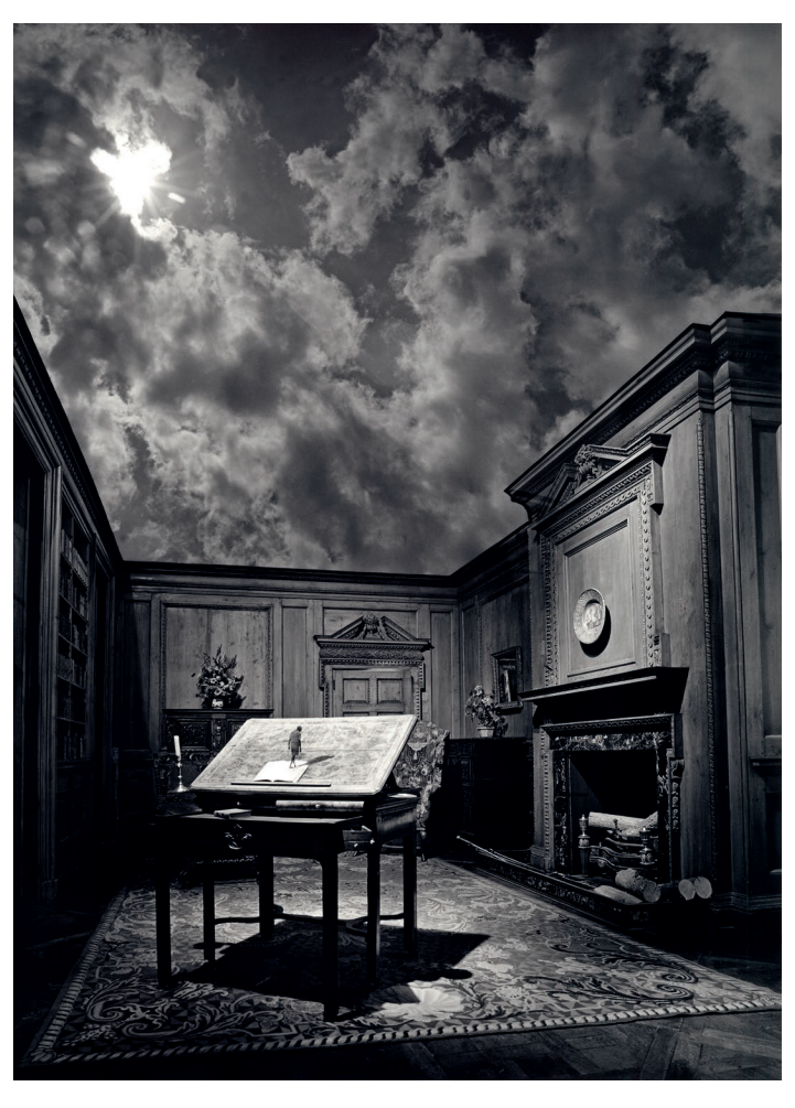
© Jerry Uelsmann, Man on Desk, 1976. 20 × 16 inches. Gelatin silver print.

made. These artists strive to recompose the world and make it personal by creating in-depth experiences that interpret their subject matter differently from previously recognized views of a similar topic. In doing so, their methodologies broaden how a photograph is perceived and interpreted by expanding the established artistic and societal preconceptions of how a photographic subject is supposed to look and what is deemed to be truthful. Hence, their transformational picturemaking is an energetic act of authentic assertion, control and organization over their topic, which extends and transforms their subject beyond boundaries of what is considered to be photographic reality.